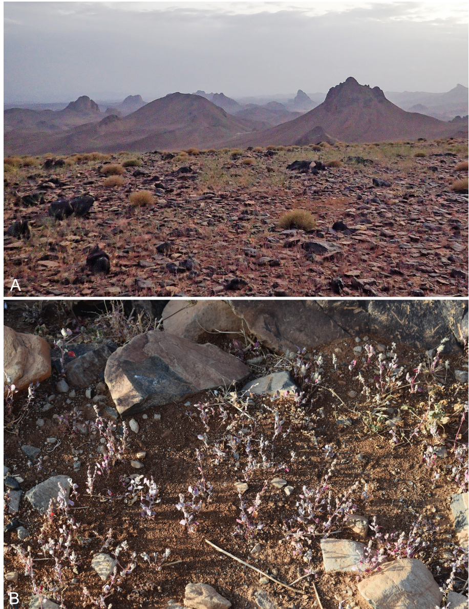
Fig. 5. A: Algeria, rocky plateau of Assekrem, 2700 m, view to south, 24 Oct 2019; B: same locality, habitat of Chenopodium hoggarens , 24 Oct 2019. – Photographs by S. Benhouhou.

Because there are some doubts about the identity of Chenopodium vulvaria var. incisum , its position is left open here.