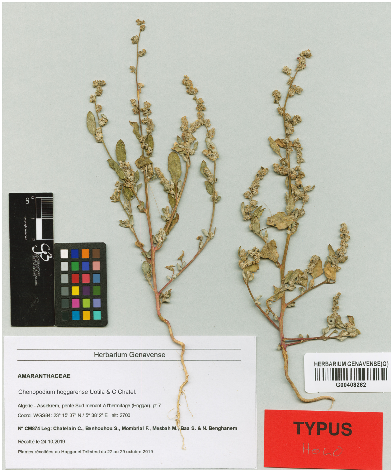
Fig. 1. Holotype of Chenopodium hoggarens (G [G00408262]).

gin entire or with a few obscure teeth, apex acute to mucronate to cuspidate; upper leaves narrowly elliptic to lanceolate (Fig. 3A). Inflorescence occupying most of plant height, composed of paniculately arranged, mostly well-spaced, dense glomerules, mostly leafless in upper 1/3 of stem and branch length, in leaf axils in lower parts. Perianth lobes 5, basally united for 1/4–2/5 of their length,