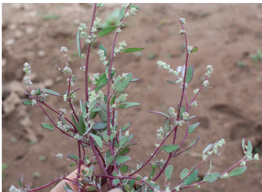
Fig. 2. Chenopodium hoggarensis , flowering and fruiting branches. – Algeria, rocky plateau of Assekrem, 2700 m, 24 Oct 2019, photograph by S. Benhouhou.

pericarp fairly thin, quite easily scraped off. Seeds lenticular with weakly acute margin, 1.2–1.3 × 1.1–1.2 mm, 0.4–0.5 mm thick, testa finely radially rugose to almost smooth.